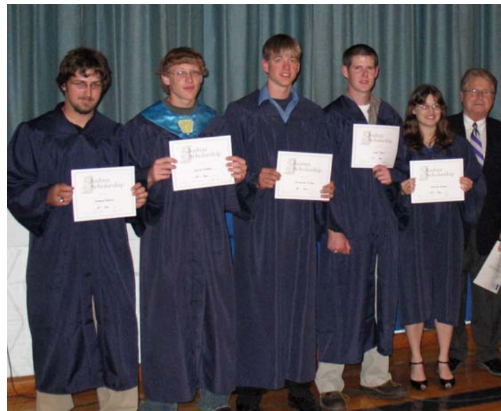
Lucas-Luray Scholarship winners.