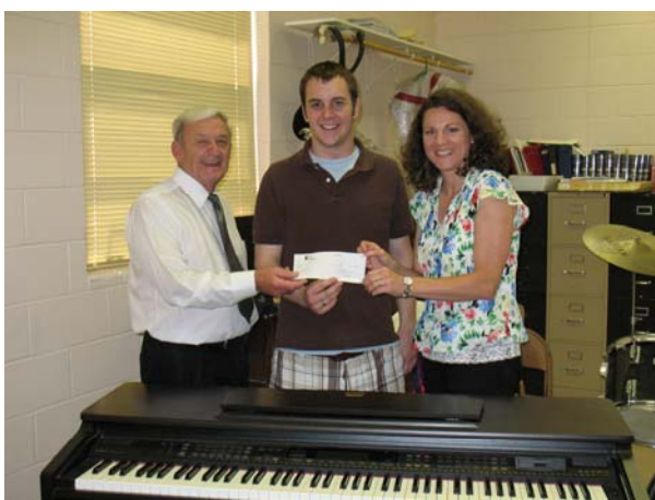
A grant for the music trip.

the RHS Music Department Spring 2009 Chicago trip for students.