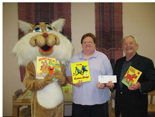
Channel Cat books for beginning readers.

To assist with the Literacy Leadership for Russell County program that provides books to children in the area.