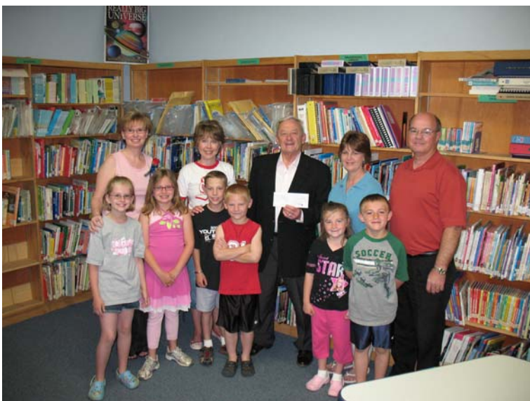
SKIP Grant—summer program for K-5

St. Mary's Catholic Church, Gorham, KS, Building & Grounds