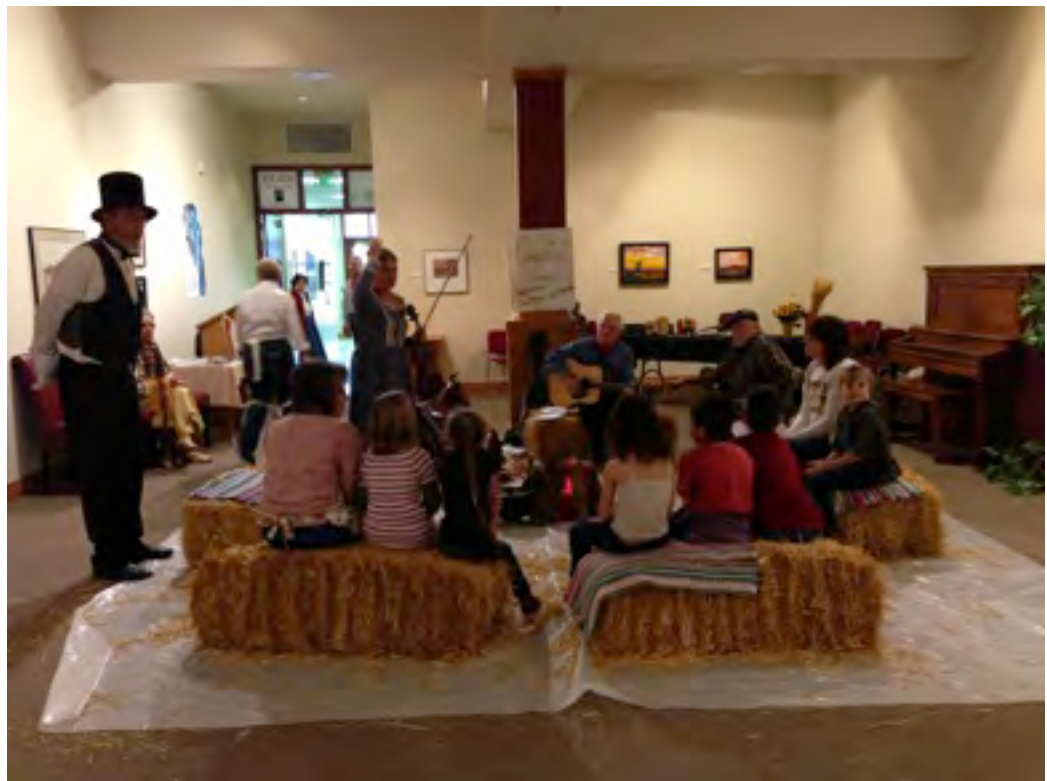
Students at the Kansas Day event participated in nature talks, campfire songs, old fashioned washing displays, butter and bread making, a wheat demonstration, and other stations related to Kansas history.